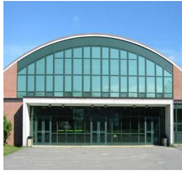
Haverhill High School, Haverhill, MA

WINDOW CORP. "Where Quality Rules" Since 1955