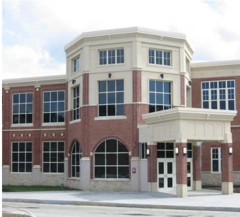
Wilson Middle School, Natick, MA