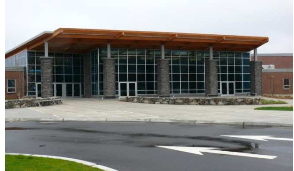
Catherine Kolnaski Elementary School, Groton, CT