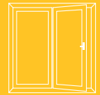
Swing Patio Door